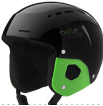
Shiny Black Green 31713 ▶ 49-52 cm 31714 ▶ 52-55 cm