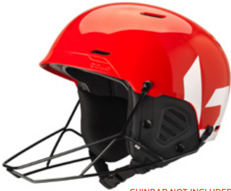
CHINBAR NOT INCLUDED