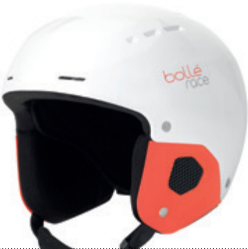
Shiny White Red 31711 ▶ 49-52 cm 31712 ▶ 52-55 cm