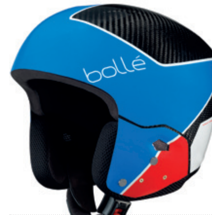
Race Blue 31884 ▶ 53-56 cm 31885 ▶ 57-60 cm

Chinbar Compatible Conform to FIS Specifications RH 2013 Multiple linings Included