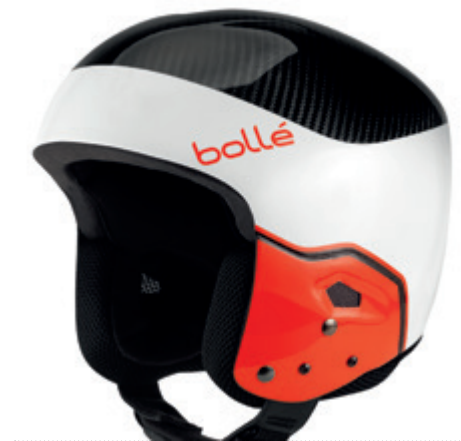
White & Red 31405 ▶ 53-56 cm 31406 ▶ 57-60 cm