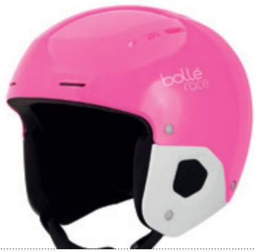
Shiny Pink White 31715 ▶ 49-52 cm 31716 ▶ 52-55 cm