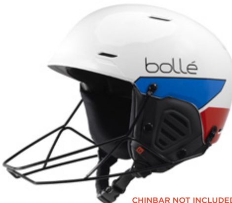
CHINBAR NOT INCLUDED