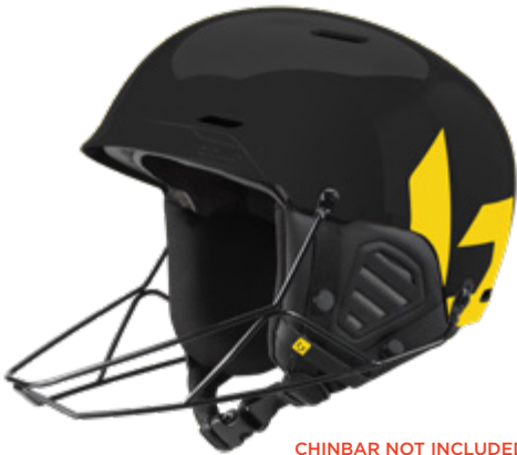
CHINBAR NOT INCLUDED