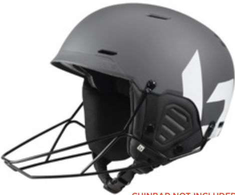
CHINBAR NOT INCLUDED