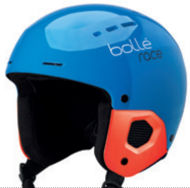
Shiny Race Blue 31930 ▶ 49-52 cm 31931 ▶ 52-55 cm

Detachable Washable Lining Weight: 590g Buckle: Classic